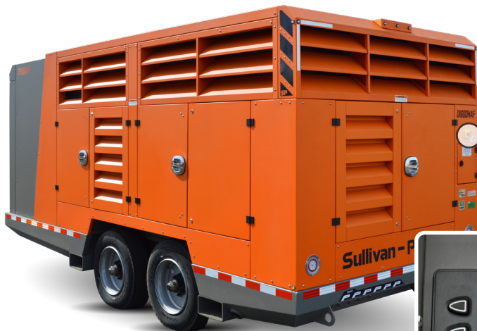
Sullivan-Palatek Electronic Controller (SPEC)